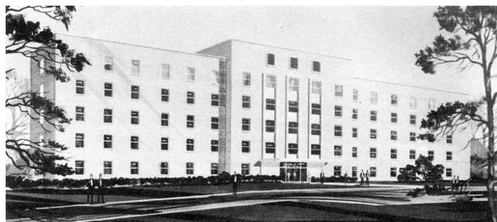
The NIDR 'National Institute of Dental Research' Building (1961)